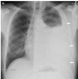
Lung x-ray of mesothelioma

The prolonged inhalation of asbestos fibres has been directly linked to the following diseases: