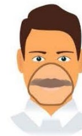
Moustache Too Wide