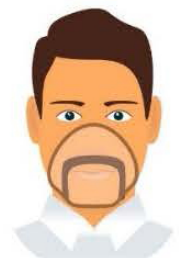
Moustache Too Long

Note: For any style, hair should not cross or interfere with the respirator sealing surface. If the respirator has an exhalation valve, hair within the sealed mask area should not impinge upon or contact the valve.